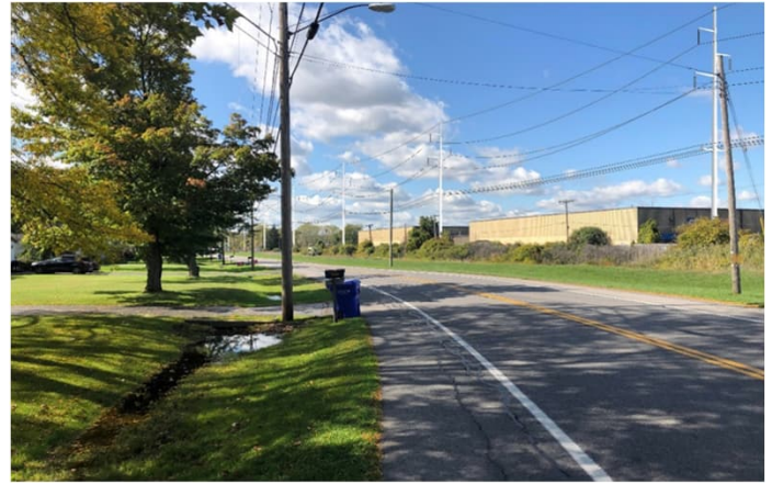
Visual simulation of new Line 949 looking west from Hinchey Road in the Town of Gates.