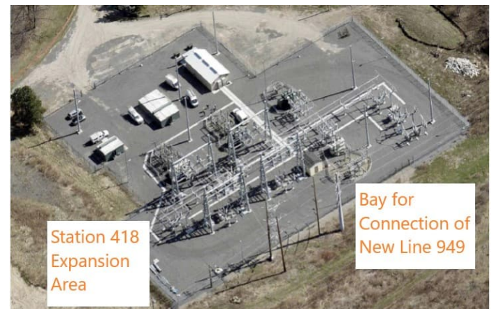
Station 418 in the vicinity of the Rochester Technology Park in the Town of Gates.